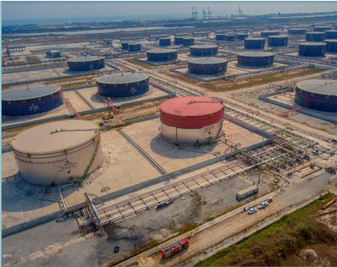
AERIAL VIEW OF INTERMEDIATE TANKS AREA