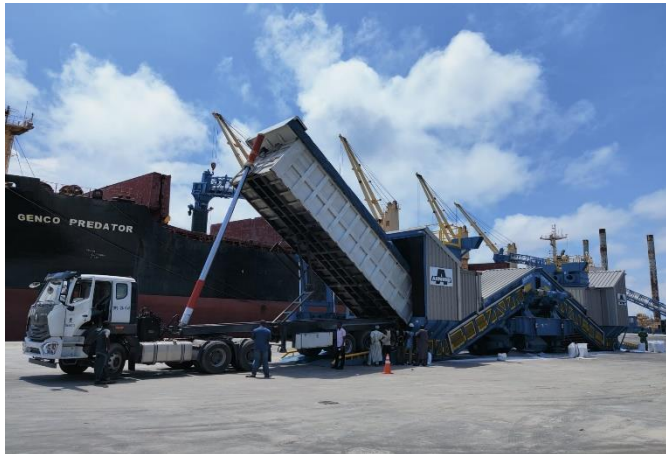
Visit to fertilizer plant and ship wharf