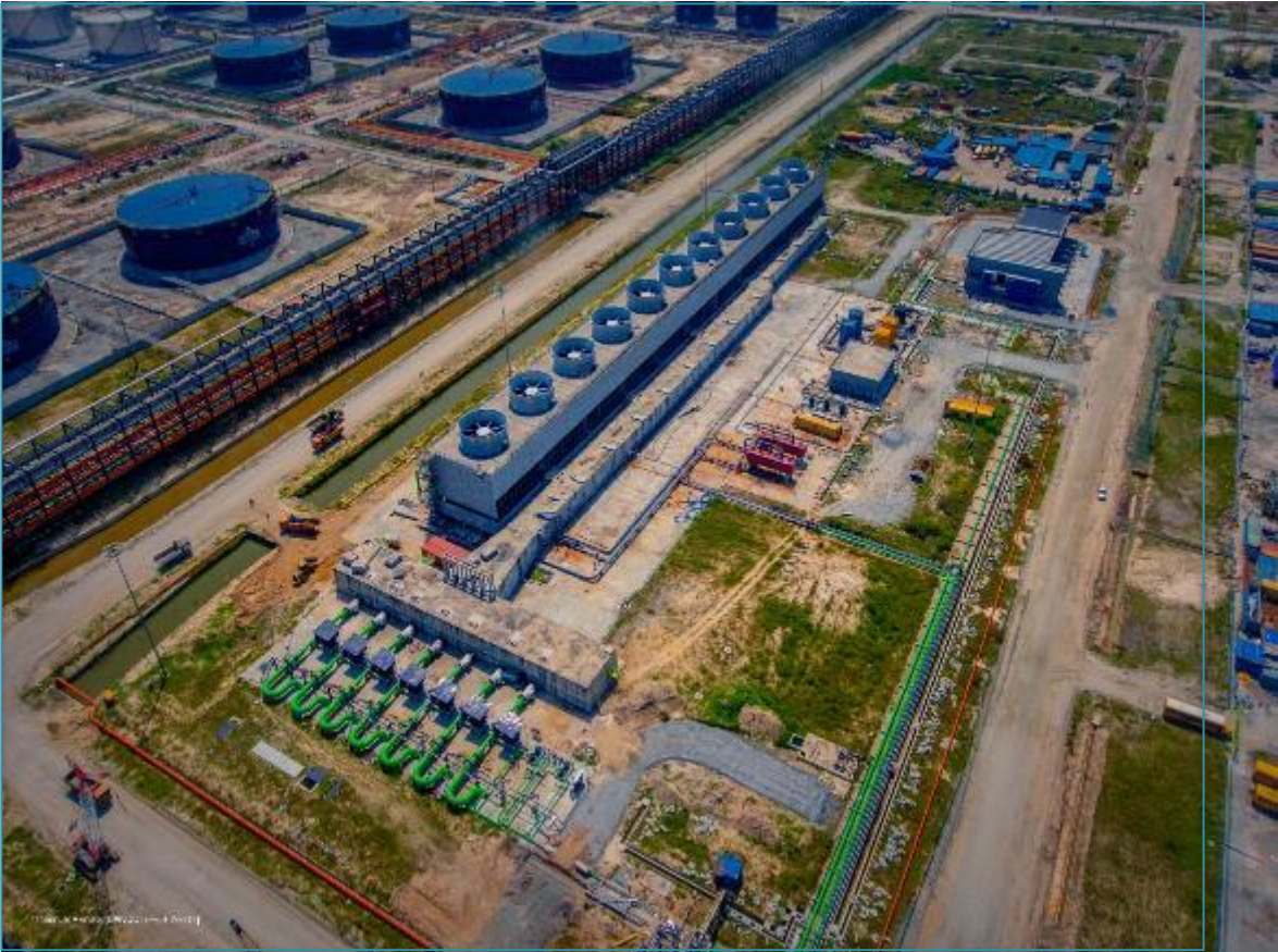
COOLING TOWER & OFFSITE PIPE RACKS