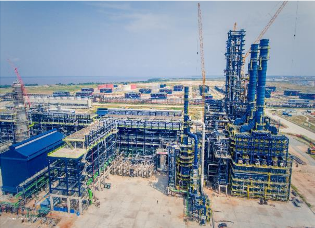
MS HEATER & HEAT EXCHANGER UNIT