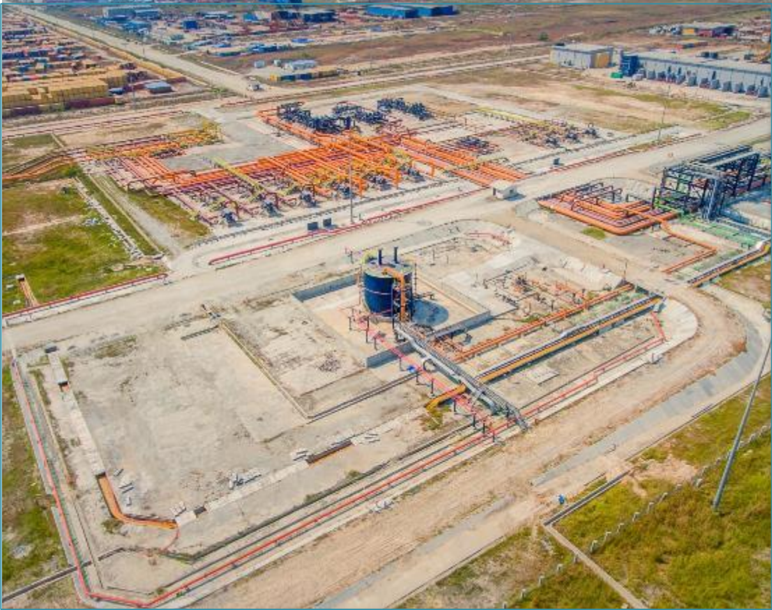
AERIAL VIEW OF PRODUCT DISPATCH TERMINAL