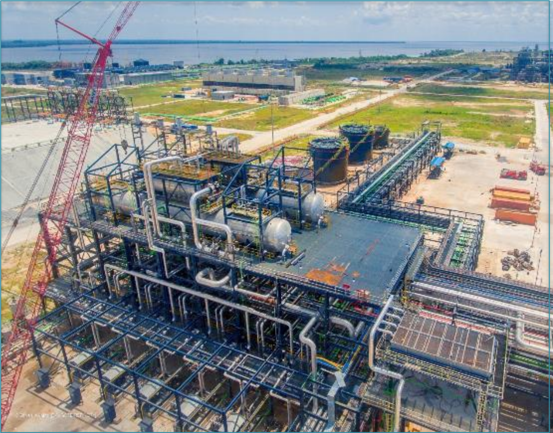
CPP CONDENSATE AREA