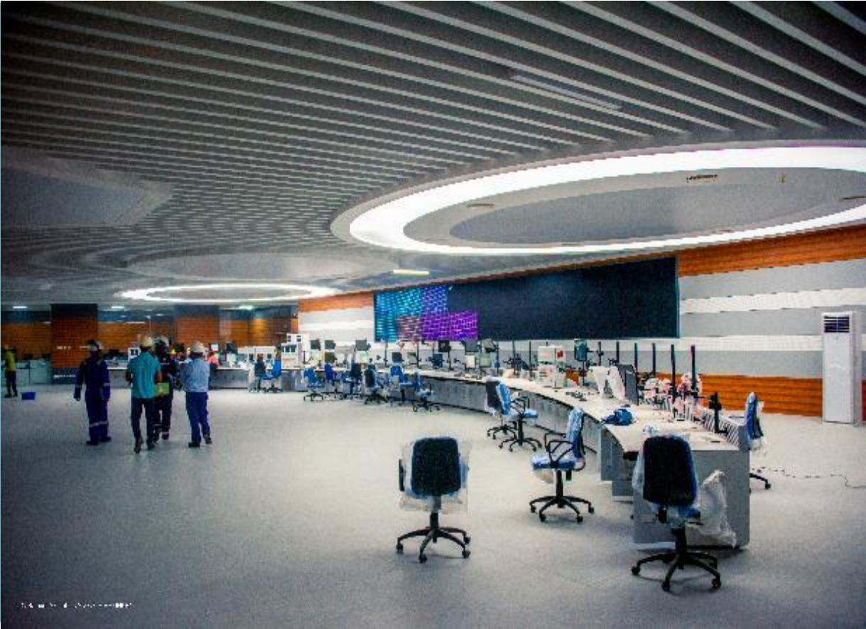
MAIN CONTROL ROOM