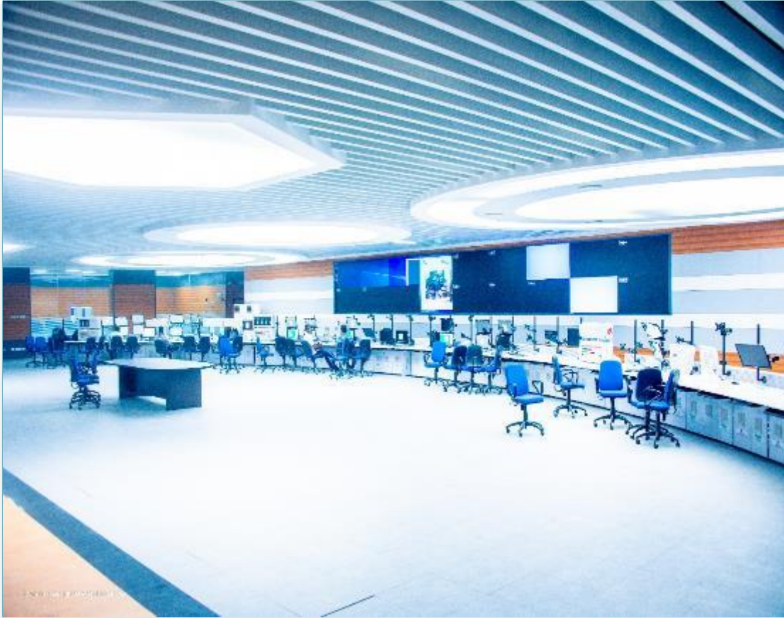
CPP CONTROL ROOM