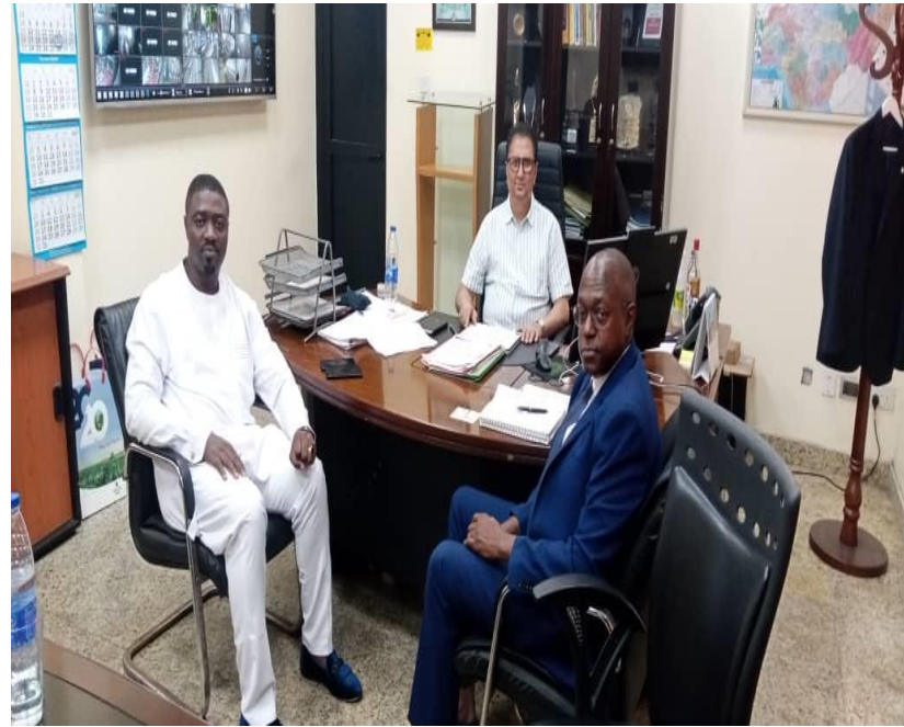
Visit Dangote sugar factory With the Group Managing Director /CEO