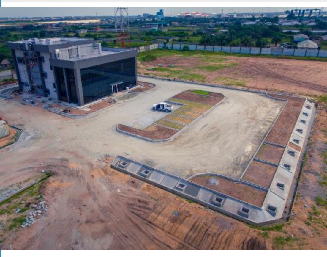
LAND FALL POINT MARINE BUILDING