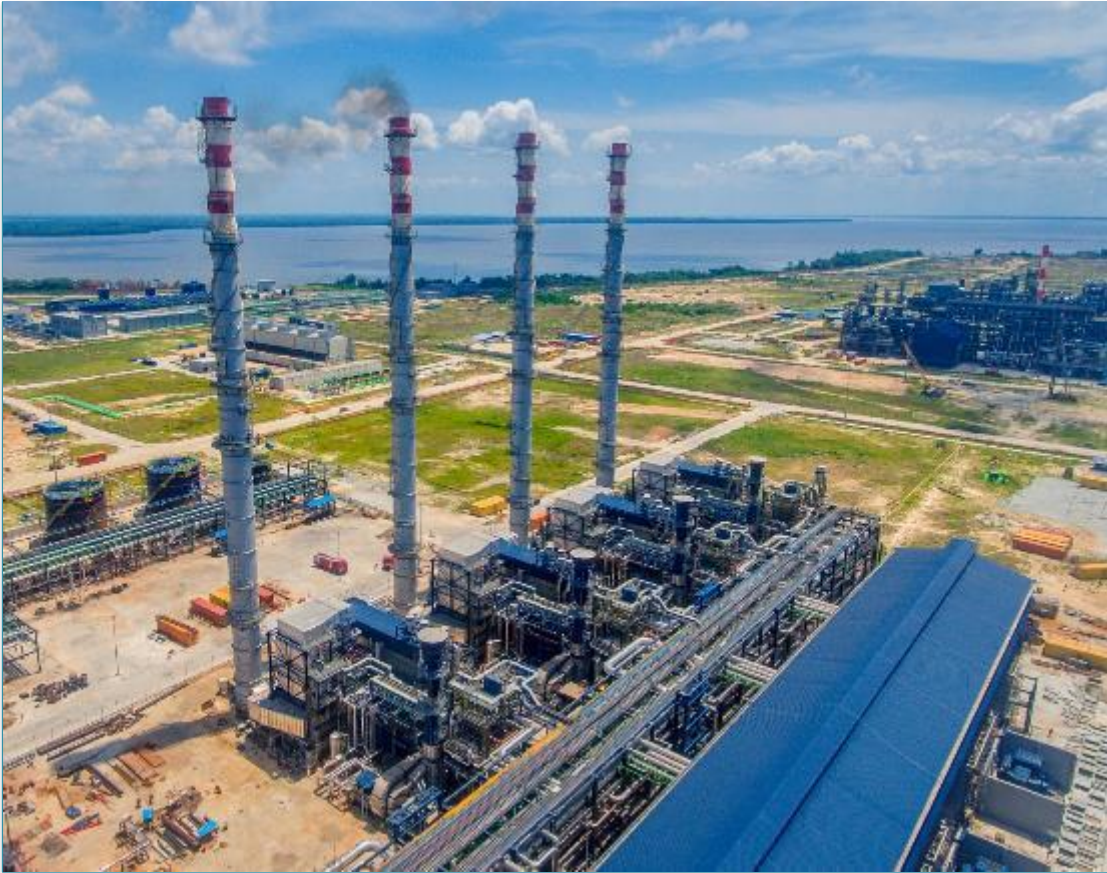
CPP UTILITY BOILERS