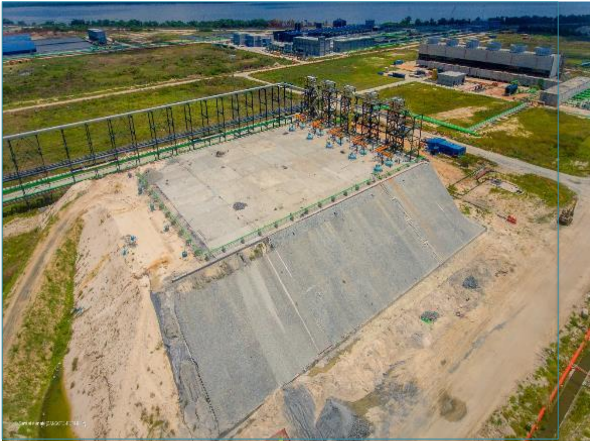
AERIAL VIEW OF MOUNDED BULLET