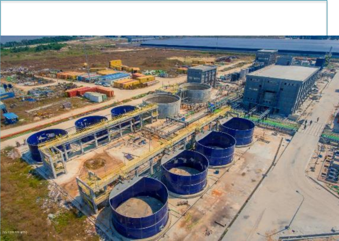
AERIAL VIEW OF ETP